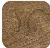
Walnut Part # GMA_W_W