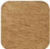
Golden Oak Part # GMA_W_GO